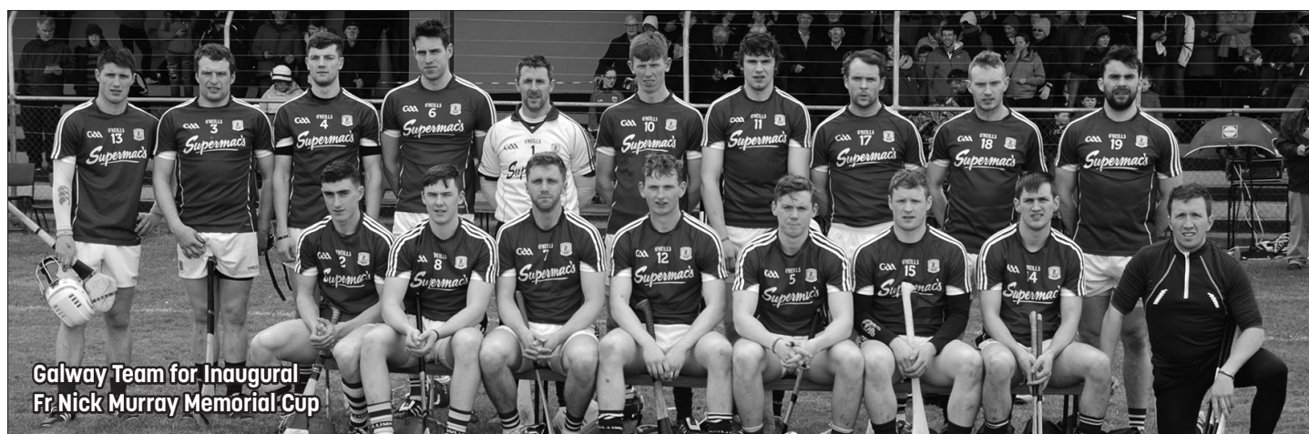
Galway Team for Inaugural Fr Nick Murray Memorial Cup