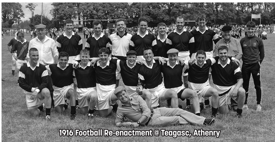
1916 Football Re-enactment @ Teagasc, Athenry